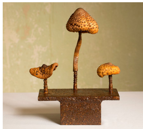
Fig. 6 Champi(gn)ons, V. meyer, 2017. Parasol mushroom, iron stand, shellac, rust (Reproduced with permission from [13])

ITNs represent one of the best funding instruments the EU is offering. They provide an ideal framework for international exchange and for building up a vital and innovative research environment where knowledge, state-of-the-art technologies and the most modern equipment can be shared. All of which is what is needed to train our next generation of high-calibre scientists, to foster their creativity and to jointly come to